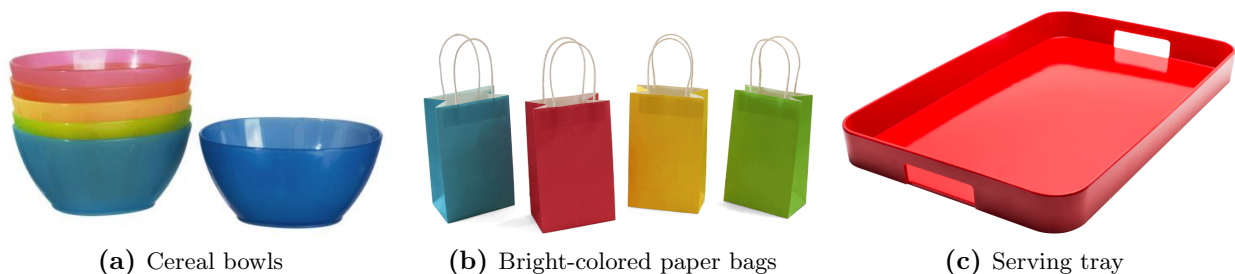
Figure 3.2: Example of object containers

During the competition, objects can be requested based on their Object Category , physical attributes, or a combination of both. Relevant attributes to be used are: