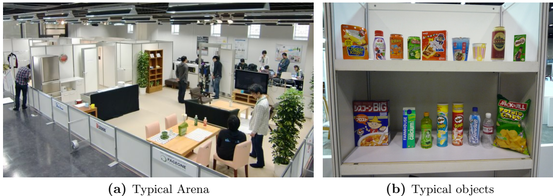
Figure 3.1: An example of a ROBOCUP@HOMEscenario