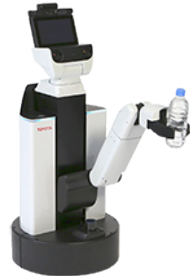
Figure 1.1: Toyota HSR

The main goal of the DSPL is to assist humans in a domestic environment, paying special attention to elderly people and people suffering from illness or disability. As a consequence, the DSPL focuses on Ambient Intelligence , Computer Vision , Object Manipulation , safe indoor Navigation and Mapping , and Task Planning . The robot used in the DSPL is the Toyota HSR , shown in Figure 1.1.